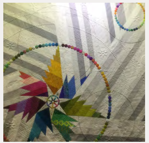
Best Of Show Quilt - 'Circling Sevenstar"

have taken a lot of time to create a quilt like this.