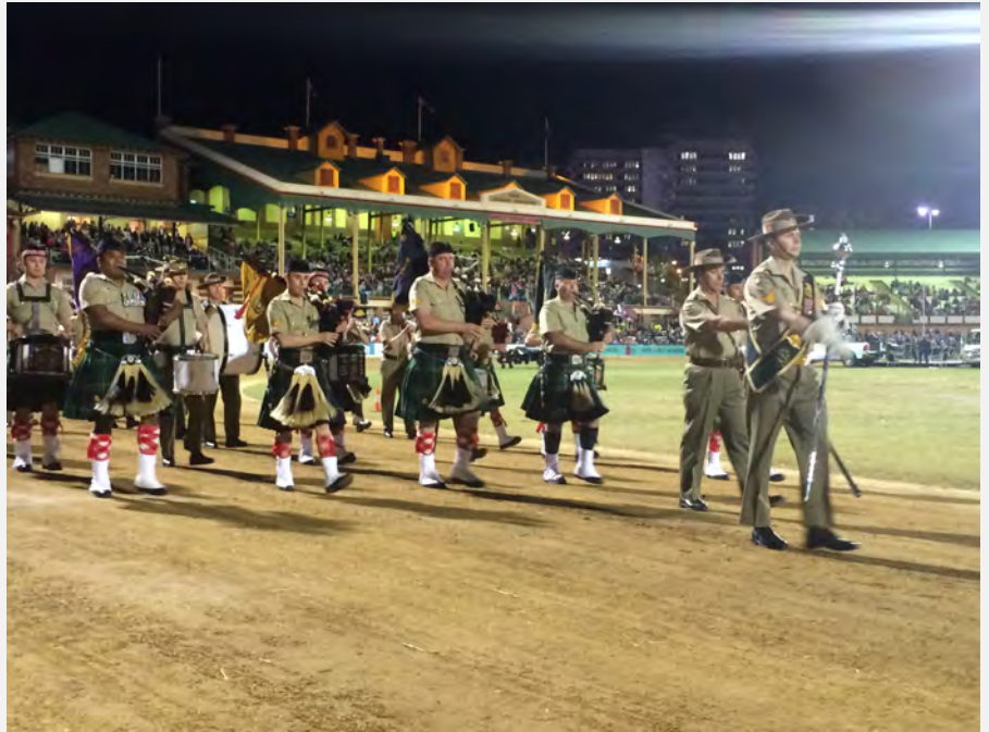
Australian Army Band, Brisbane accompanying the parade made up of members 8th / 9th Battalion, The Royal Australian Regiment.